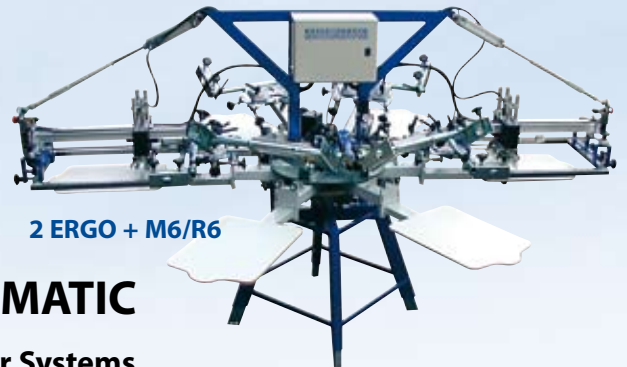
2 ERGO + M6/R6